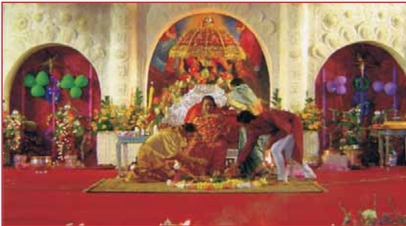
Christmas Puja, 2003

Regarding today's great advent of Shri Jesus Christ, I told them that He came on this earth with a very great mission, I would say one of the greatest missions; because He wanted to open this Agnya Chakra which was so constricted, and could not be done before. For that He had to sacrifice His life. By that sacrifice only, the great Agnya could be opened. He was aware of it, He knew that it has to happen - that He had to somehow accept this sacrifice. As it is, He was a Divine personality. He had no problem in doing so; but He thought that there could be some other way whereby you can open this Agnya Chakra.