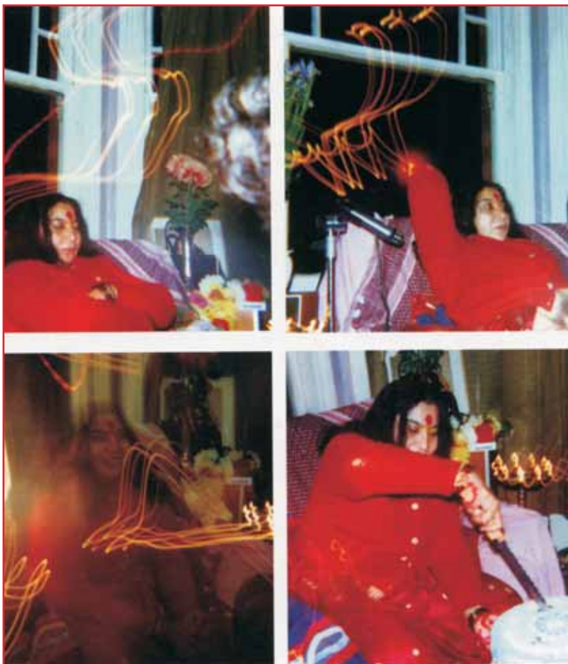
Miracle photos taken during the December 1979 Guru Puja

but for granting them the Kingdom of Heaven, the joy, the bliss that your Father wants to bestow upon you.