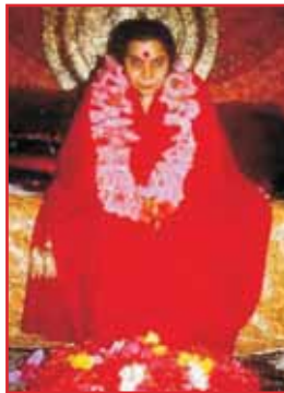
Shri Ganesha Puja, Sydney, 1981