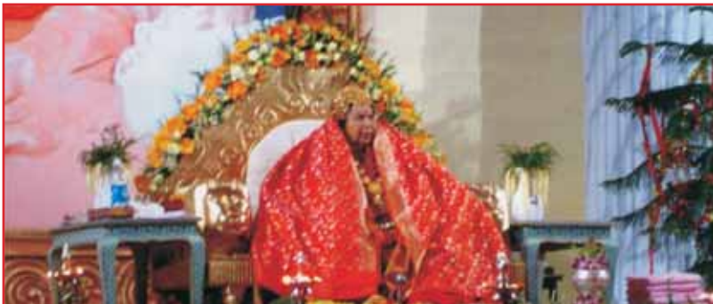
Shri Mataji at the Christmas Puja 2004

'Father, the glory which Thou hast given Me I have given to them, that they may be one even as We are one, I in them and Thou in Me, that they may become perfectly one, so that the world may know that Thou hast sent Me and hast loved them even as Thou hast loved Me.' John 17.22