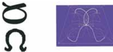
Alpha and Omega

Rotating the model to another angle shows those symbols change into the Greek letters Alpha and Omega.