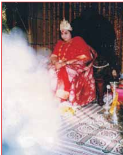
Christmas Puja, Ganapatipule 1985 The light is a deity worshipping Shri Mataji