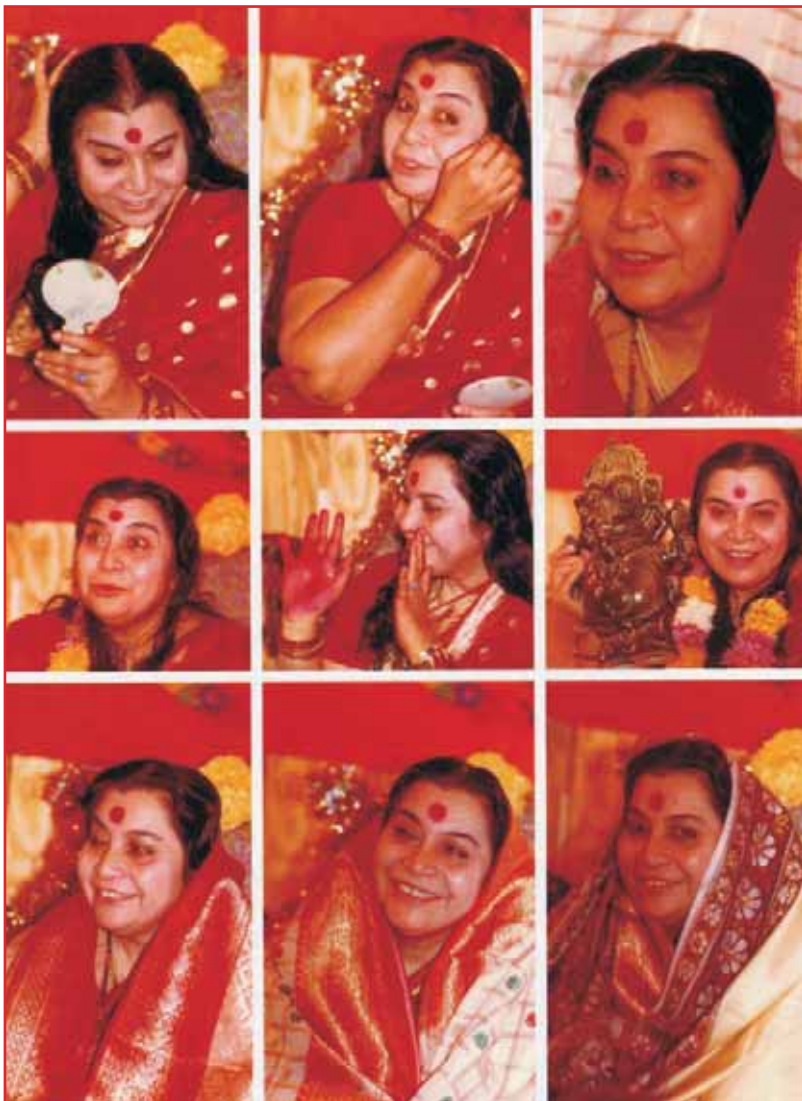
Christmas Puja, 1981, London