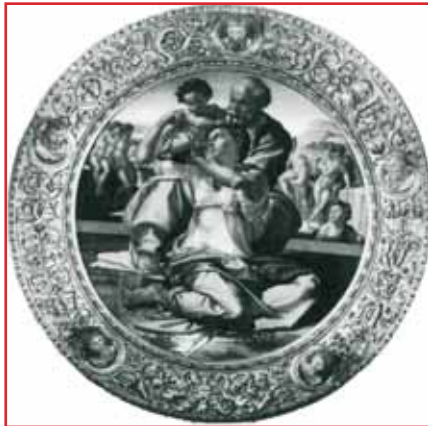
The Holy Family, by Michelangelo

Sakshat Shri Adi Shakti Mataji Shri Nirmala Devi namo namah