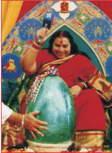
Shri Mataji smashing a chocolate Easter egg Easter Puja, Sydney 1991

you mature fully inside, the bird is ready and that is the time you are hatched. This is the time you get twice-born. So, the Resurrection of Christ signifies that, and that's why we give that egg to people, saying you are that, an egg, a reminder of that. And this egg can become a Spirit.