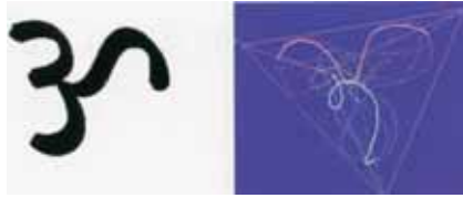
Part of the Om sign, the Omkara

When this configuration was viewed from certain angles the physicist was surprised to find that the spirals formed recognizable symbols. In the first view a 3-dimensional Omkara could be seen.