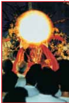
I am the light (miracle photo)

Even Christ said, 'I am the Light, I am the path,' because He is the Omkara. He is the path and He is the door, He is the gate. And everybody will have to pass through His gate. He never told lies, but they crucified Him. They just crucified Him, because Christ could not talk much and whatever He said was written down by His disciples the way they understood. To understand Christ you have to have your Realisation.